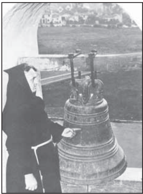
This Santa Barbara Mission bell was cast in Lima, Peru in 1818.

In addition to the big bells in the towers, Mission Santa Barbara had a bell wheel in the church. This was a wooden stand with a wheel covered with small bells attached to the rim. A