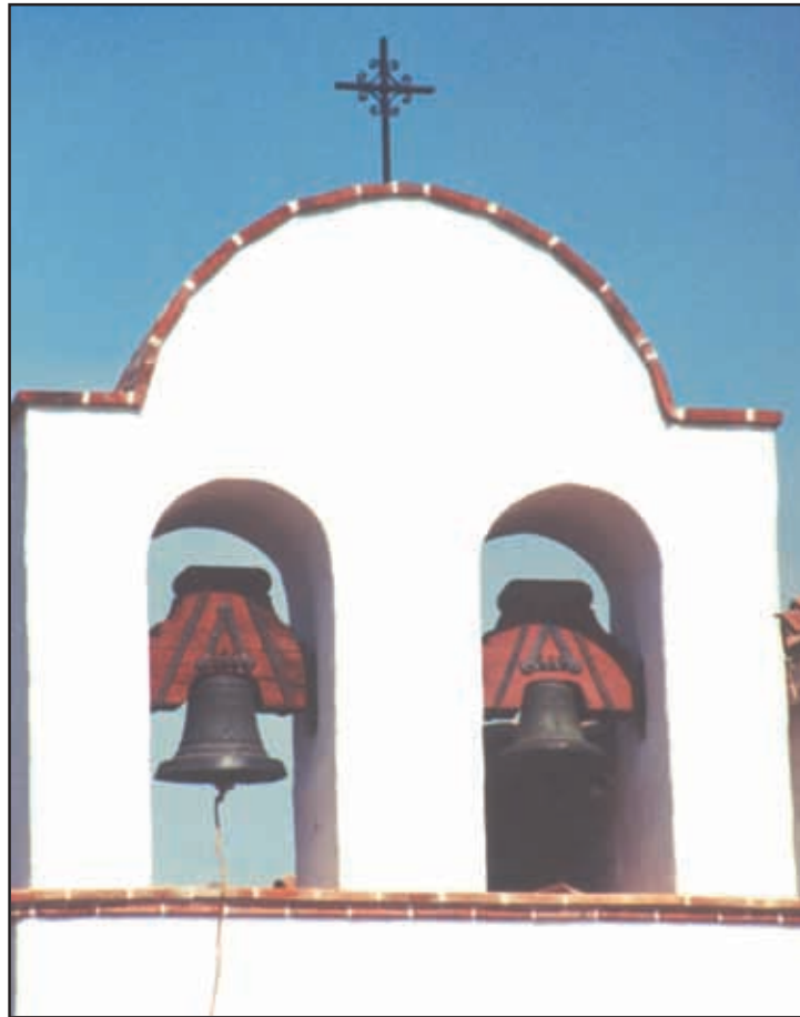
Chapel bells were recently restored at the Presidio.

When have you seen a church without a bell tower? Since life is often centered around religion, bells have had many religious uses, marking times of prayer, mourning and rejoicing. How many bells can you find around town? Listen for their chimes and think about the wonderful history of bells!